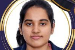
AIR 12 Al Jamila