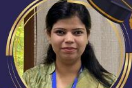
AIR 18 Anamika